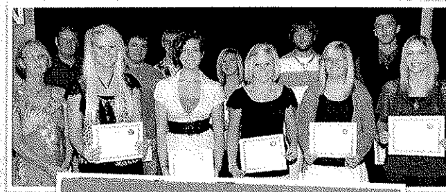
Fall 2011 IGNITE Scholarship Recipients